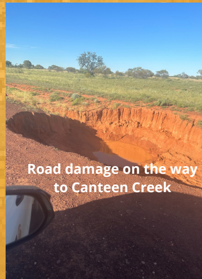
Road damage on the way to Canteen Creek