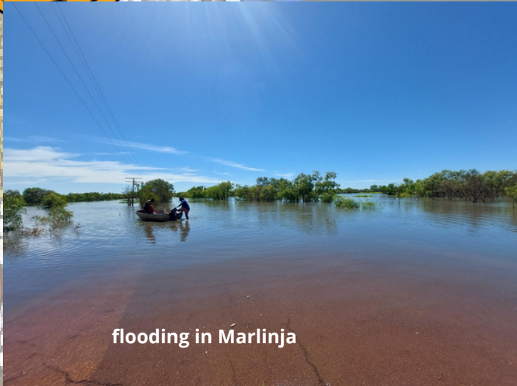
flooding in Marlinja