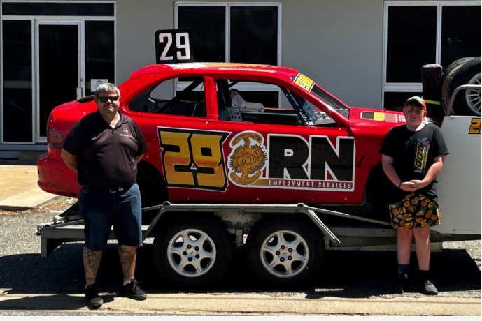
RN Employment Services also proudly sponsor the Fast Carse Racing Team in the junior division.